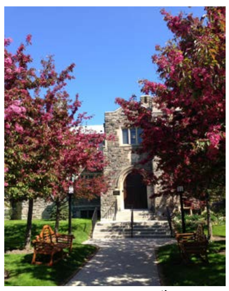
April 14, 2024 9:15 a.m. (pages 2-5) 11:00 a.m. (pages 6-8)