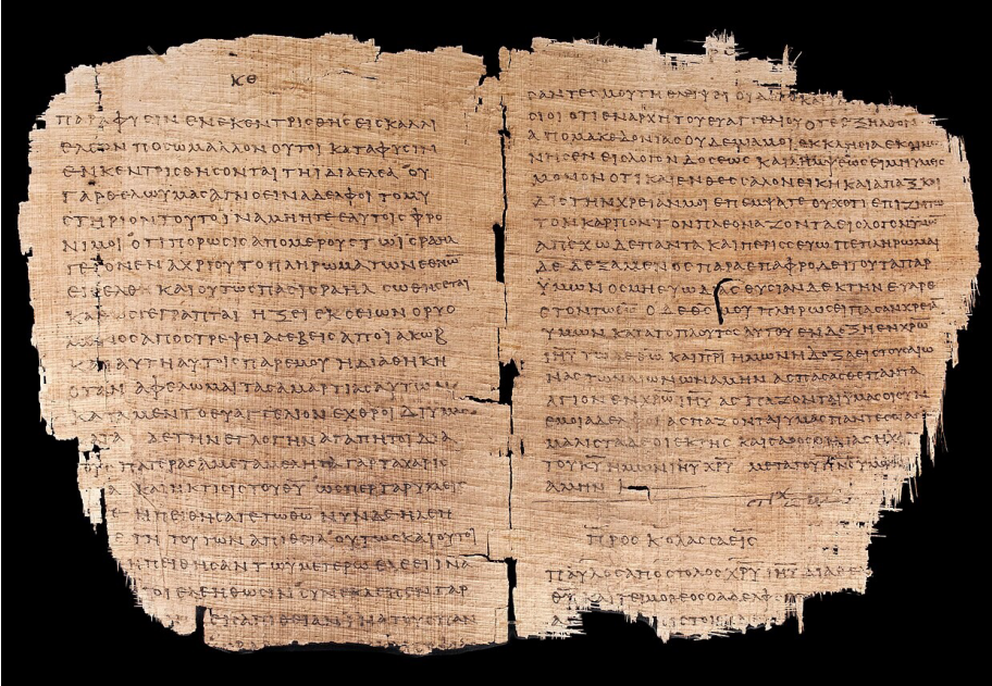
From the earliest full manuscript of Paul's letter to the Romans

SUNDAY, APRIL 19, 2026 CONTEMPORARY – 9:15 AM TRADITIONAL – 11:00 AM