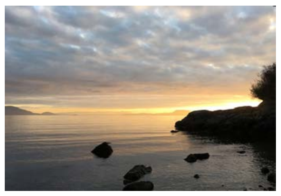
Looking toward the dawn - Priscilla Stuckey